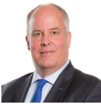
Andrew RT Davies AM Welsh Conservatives South Wales Central