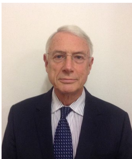
Sir Roderick Evans Commissioner for Standards December 2016 – November 2019

Email: Standards.Commissioner@senedd.wales