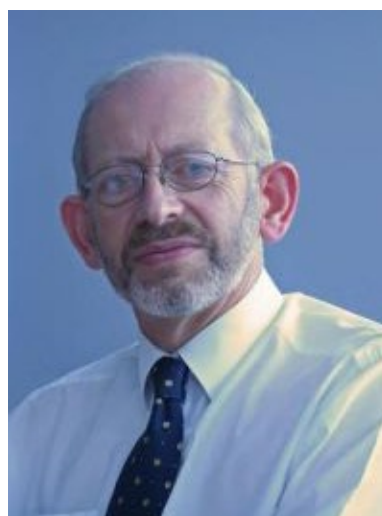
Douglas Bain CBE TD Acting Senedd Commissioner for Standards November 2019 – Present